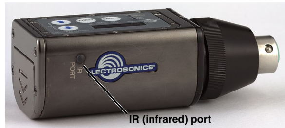
IR (infrared) port

Audio Input Jack: Standard 3-pin XLR (female) Phantom Power: 5V @ 18 mA max., 15V @ 15 mA max. and 48 V @ 4 mA max., plus "OFF" USB port: Used for firmware updates IR (infrared) port: For quick setup by transferring settings from an IR enabled receiver Antenna: Housing and attached microphone form the antenna Battery: Two 1.5 Volt AA alkaline Battery Life (Duracell Quantum): AA alkaline; No Phantom Power: 5h 0m* AA alkaline; 48V Phantom Power: 3h 30m** *Tested with a dynamic microphone **Tested with a Sanken CS1 for a phantom-powered microphone Weight: 6.7 oz (190 grams) without batteries Dimensions: 4.25x1.62x1.38 inches Emission Designator: 180KF3E