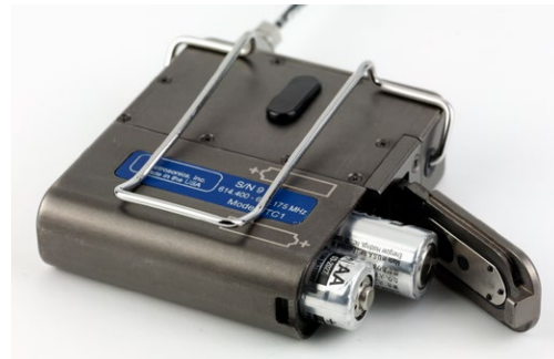
A mached aluminum, hinged door maintains reliable battery contact.