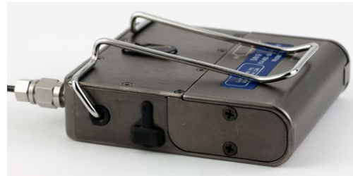
A USB port on the side panel is used for firmware updates.

Digital Hybrid Wireless® is a patented design that combines 24-bit digital audio with an analog FM radio link to provide outstanding audio quality and the extended operating range of the finest analog wireless systems.